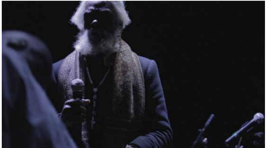
© Theaster Gates. Courtesy of Theaster Gates and White Cube

Theaster Gates frequently collaborates with the Black community of Chicago's South Side. In the video Billy Sings Amazing Grace , Gates and his musical ensemble, The Black Monks, rehearse with soul singer Billy Forston, riffing on the melody, lyrics and history of 'Amazing Grace'. The hymn, originally written by a British poet for a Christian context in the late eighteenth century, has been appropriated and reinterpreted within African American folk traditions and spirituals sung by enslaved African people during the slave trade in the United States. The deep emotional and spiritual significance of the hymn resonates powerfully in this remarkable performance.